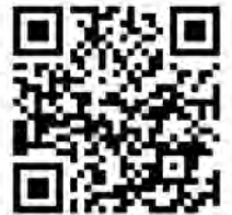
QR Code to Donation Web-page

Your gift of $30 per month will allow this child to attend school in Guatemala. Although public education is free, children often work to provide food for their families and they cannot afford the cost of uniforms and supplies. Your support will help purchase school uniforms and supplies as well as providing bulk food (rice, beans, corn, eggs, etc.) for both the child and family. Thank you for helping to build this community one child at a time.