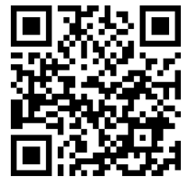
QR Code to Donation Web-page

Your gift of $30 per month will allow this child to attend school in Guatemala. Although public education is free, children often work to provide food for their families and they cannot afford the cost of uniforms and supplies. Your support will help purchase school uniforms and supplies as well as providing bulk food (rice, beans, corn, eggs, etc.) for both the child and family. Thank you for helping to build this community one child at a time.