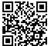
QR Code to Donation Web-page

Your gift of $30 per month will allow this child to attend school in Guatemala. Although public education is free, children often work to provide food for their families and they cannot afford the cost of uniforms and supplies. Your support will help purchase school uniforms and supplies as well as providing bulk food (rice, beans, corn, eggs, etc.) for both the child and family. Thank you for helping to build this community one child at a time.