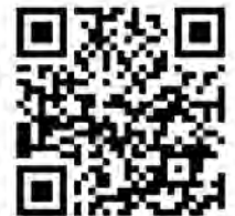
QR Code to Donation Web-page

Your gift of $30 per month will allow this child to attend school in Guatemala. Although public education is free, children often work to provide food for their families and they cannot afford the cost of uniforms and supplies. Your support will help purchase school uniforms and supplies as well as providing bulk food (rice, beans, corn, eggs, etc.) for both the child and family. Thank you for helping to build this community one child at a time.