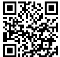
QR Code to Donation Web-page

Your gift of $30 per month will allow this child to attend school in Guatemala. Although public education is free, children often work to provide food for their families and they cannot afford the cost of uniforms and supplies. Your support will help purchase school uniforms and supplies as well as providing bulk food (rice, beans, corn, eggs, etc.) for both the child and family. Thank you for helping to build this community one child at a time.