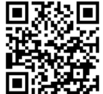
QR Code to Donation Web-page

Your gift of $30 per month will allow this child to attend school in Guatemala. Although public education is free, children often work to provide food for their families and they cannot afford the cost of uniforms and supplies. Your support will help purchase school uniforms and supplies as well as providing bulk food (rice, beans, corn, eggs, etc.) for both the child and family. Thank you for helping to build this community one child at a time.