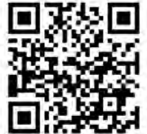
QR Code to Donation Web-page

Your gift of $30 per month will allow this child to attend school in Guatemala. Although public education is free, children often work to provide food for their families and they cannot afford the cost of uniforms and supplies. Your support will help purchase school uniforms and supplies as well as providing bulk food (rice, beans, corn, eggs, etc.) for both the child and family. Thank you for helping to build this community one child at a time.